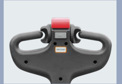
The upright-tiller running function allows it to work within confined space, such as container