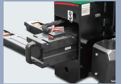
Easy for exchanging battery