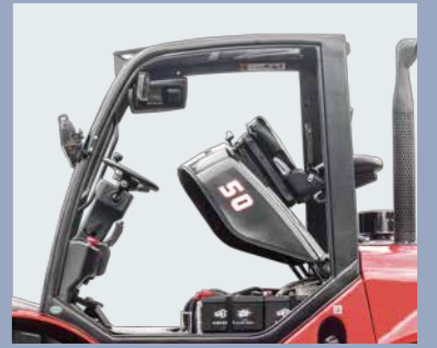
The easy-to-open hook provides quick access to the engine compartment