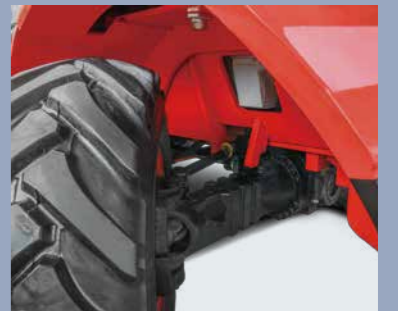
Oscillating steer axle allows either wheel to step over obstacles keeping the truck and load level