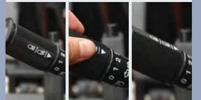
Three forward gears- Suspension hydraulic transmission with three forward gears, top speed reach 25km/h