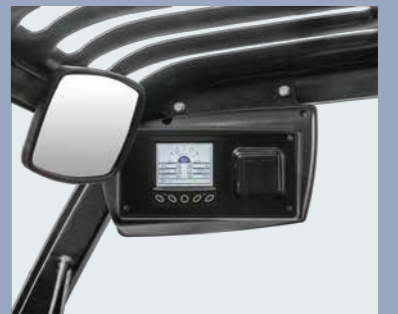
Large screen display, the instrument panel adopts injection molding design, sturdy and durable