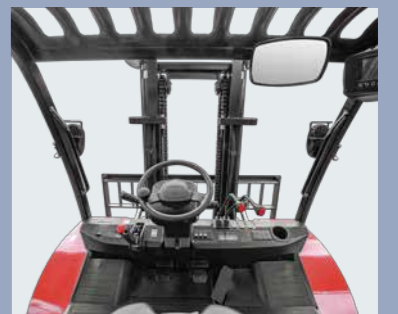
To achieve maximum productivity, a rough terrain forklift operator needs to be comfortable and in control. We've created a workplace that gets the best from your operators and your machinery